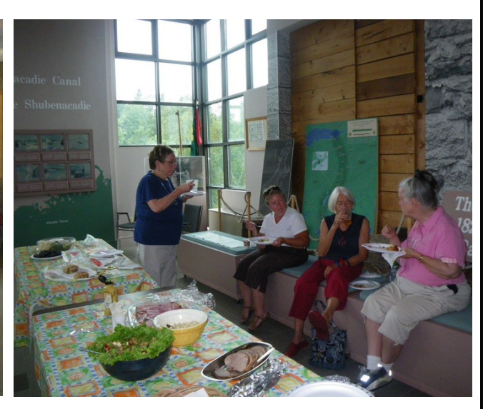
Selection of photos from the BIO-OA Picnic at the Fairbanks Centre, Dartmouth.