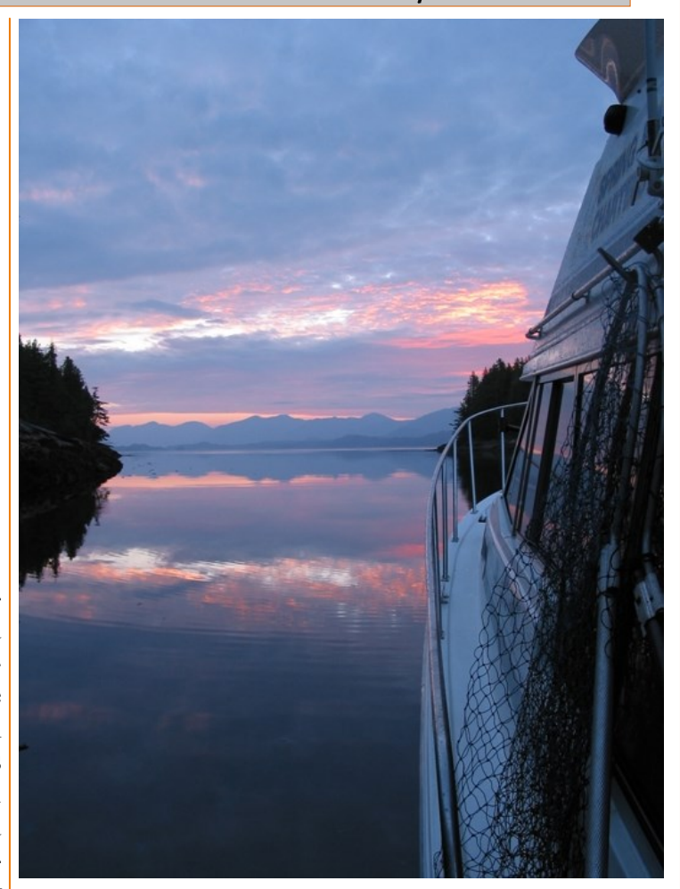
Sunset on Douglas Channel, BC. This channel is one of the principal inlets of the British Columbia Coast; the town of Kitimat is on Kitimat Arm at the head of Douglas Channel.

As for the benefit of the Northern Gateway pipeline to "Canadians", this is both conjectural and questionable. The evolution of Canadians toward oil as their single, dominant, economic driver moves us toward the status of a petro-state with all the accompanying financial instabilities, budgetary uncertainties and democratic corrosion. Although the JRP finds that "the project, if constructed, would likely deliver economic benefits by expanding and diversifying the markets available for western Canadian crude oil exports", it also acknowledges that it is "difficult to determine, with certainty, the effect the Northern Gateway Project may have on broader market prices once it is placed in service...". In other words, the addition of Alberta dilbit to the international market