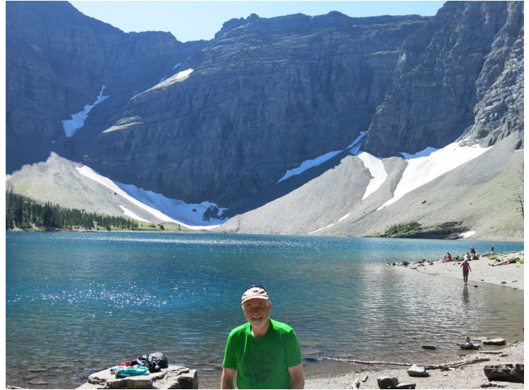
Fig. 2: Crypt Lake – a picturesque lunch spot.

sects the park and the international boundary, and the small town on the lake allows easy access to the surrounding wilderness.