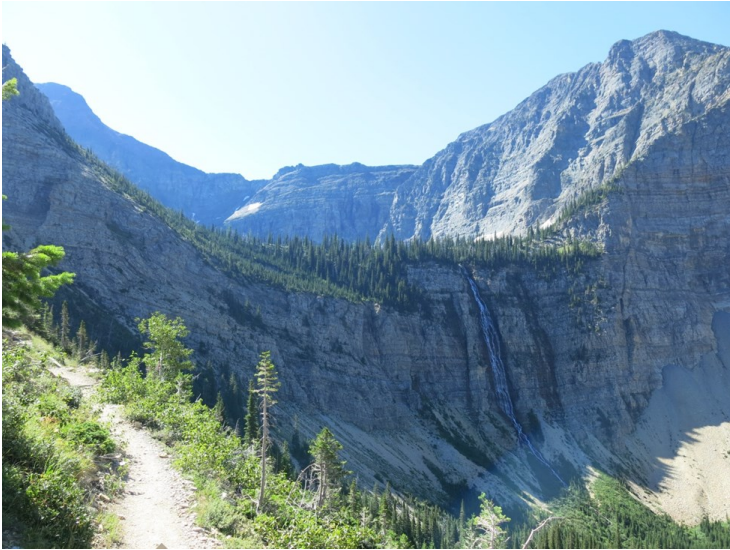
Fig. 1 The tunnel, Crypt Falls, and the rock wall that holds in the lake.