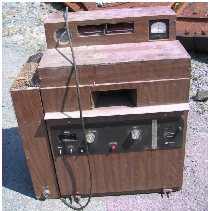
The prototype Autosal .

In the mid-70s, it was noted that the conductivity cell on the CTD was responding not only to salinity changes in the ocean but also to particles passing through it. It was concluded that these particles were zooplankton for the most part and if their length, diameter, and numbers could be determined, the resulting device would be an excellent addition to the phytoplankton survey system that Alex Herman had created on the Batfish towed vehicle. While Tim worked on the design of an electronic system to measure the characteristics of copepods passing through the cell and devised efficient ways of transmitting this data to the surface in real time, Alex and his team of Michel Mitchell, Ted Phillips, Jean-Guy Desureault and Scott Young dealt with the problem of persuading the copepods to pass through the tiny orifice of the cell, integrating the technology onto Batfish and devising appropriate laboratory and atsea calibration procedures. The combined effect of these initiatives permitted users to identify and count dominant copepod species. The device became an integral part of the biological Batfish system and was used successfully during many operations off Nova Scotia and even as far away as Peru. This program eventually led to Alex Herman's development of the Optical Plankton Counter (OPC), a project in which Tim was an active member of the de-