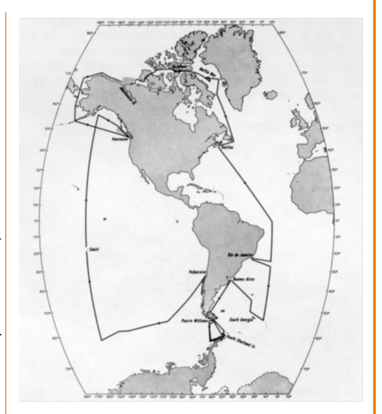
Hudson's track and main ports of call.

From the vicinity of south Georgia, Hudson sailed to Buenos Aires, then south to work between South America and Antarctica. Four buoys, each carrying three current meters and three temperature recorders were laid across the Drake Passage and recovered