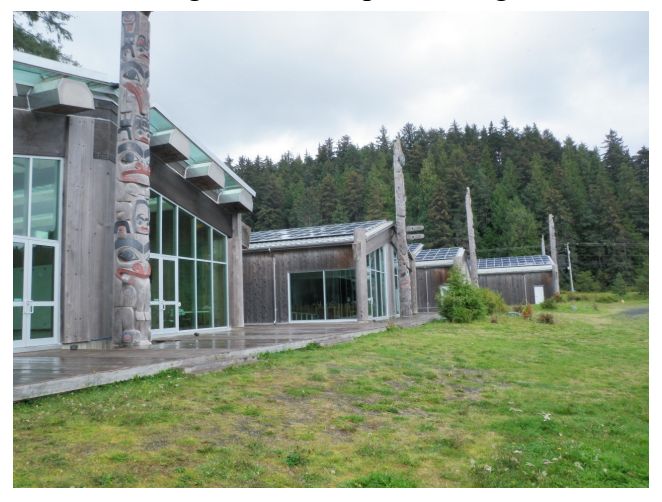
Haida Gwaii Museum

We enjoyed visiting the numerous museums, galleries and craft shops throughout Graham Island using our rental car. Most impressive was the Haida Gwaii Museum just outside Skidegate. It is housed in series of reconstructed longhouses with poles along the beach.