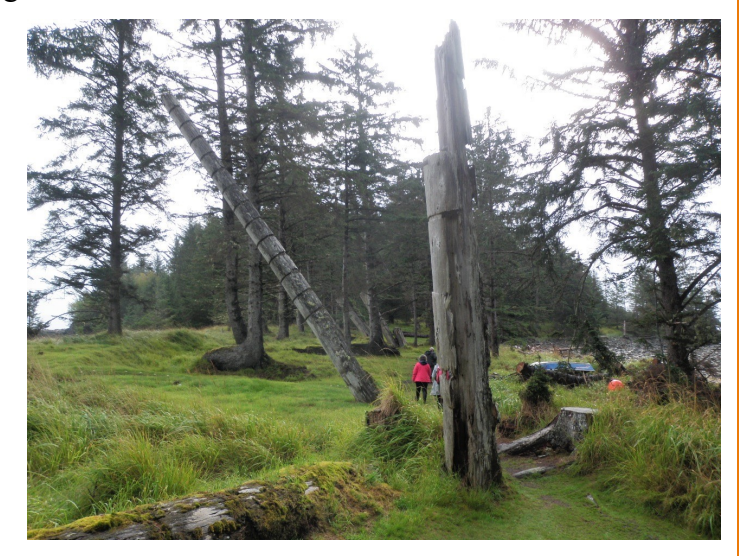
Skedans, Louise Island

Scheduled stops for the day were Skedans, Hotspring Island and Windy Bay. Time and distance did not allow us to visit Anthony Island (also a UNESCO World Heritage site) and Tanu, the two other Haida heritage sites. During the summer, these five sites are occupied by resident Haida watchmen to protect the natural and cultural heritage of the abandoned village sites, provide information to visitors and assist in cases of emergencies.