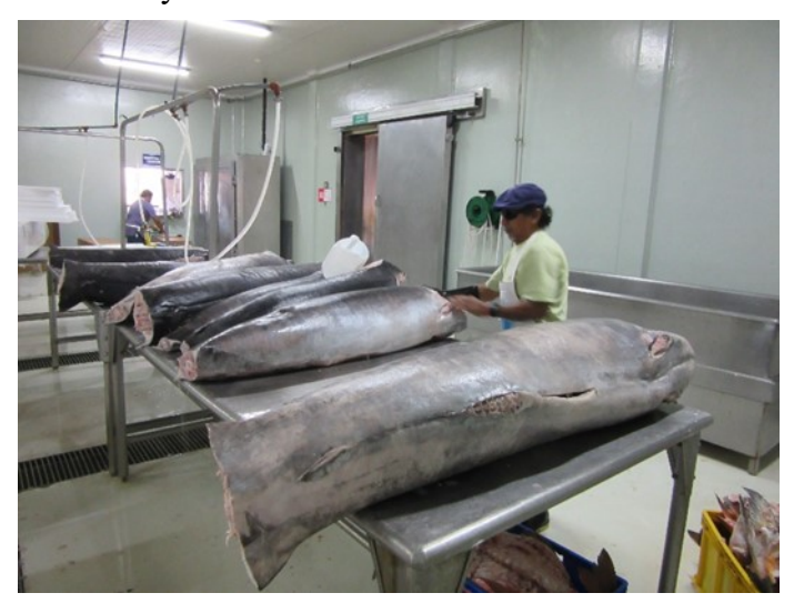
Processing swordfish for international markets.

territory. Additionally, advisors would need expertise in fisheries issues with a focus on the industrial sector, specifically the practices related to the processing of fishery products. They would be required to contribute to the preparation of an appropriate roadmap for the promotion of mariculture (Pacific oyster culture) in Ecuador, and to impart theoretical and practical training in the analysis of biotoxins in fish and antibiotics used in the aquaculture industry with the aim of expanding and improving the knowledge base of technical personnel in the Ministry.