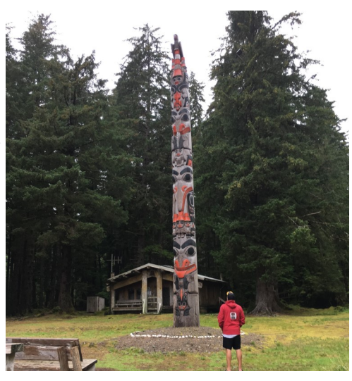
Legacy Pole, Lyell Island

clear-cut logging practices on Moresby Island. This event resulted in the creation of Gwaii Haanas and the erection of a legacy pole that had been recently restored. We were also taken on a hike through more old growth forest to see a thousand year old Sitka spruce tree.