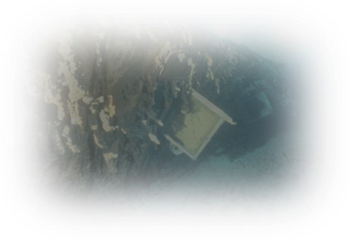
Just what will be seen in 2021- intact, corroded by rusticles, collapsed?

To keep abreast of cultural and scientific developments, join TSAC. General meetings are held Sunday afternoon, trimonthly at the Maritime Museum of the Atlantic. For more information and meeting dates contact: <a href="mailto:titanicsociety@eastlink.ca">titanicsociety@eastlink.ca</a>) or the MMA website events calendar.