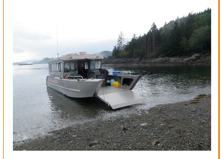
Tour boat to Gwaii Haanas

Without a doubt the highlight of our trip was our visit to Gwaii Haanas, the remote southern half of Haida Gwaii. Gwaii Haanas translates as 'Islands of Beauty' and is an international treasure. It includes a National Park Reserve, a National Marine Conservation Area and the Haida Heritage Site. For more than 12,500 years, the lives of the Haida have been interwoven with this remarkable environment. Their communities thrived on the abundance of the sea, sky and land that provided resources as well as cultural and spiritual sustenance. Haida knowledge of their homeland is intimate and rich with the teachings of generations. Because of this deep connection to the environment, the Haida joined the effort to stop logging. In 1985, the standoff on Lyell Island with the logging industry brought the conflict to a head and drew international attention. This led to the unique situation where the Council of the Haida Nation and the Government of Canada negotiated an agreement